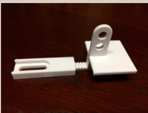
FLUSH FIT END STOP